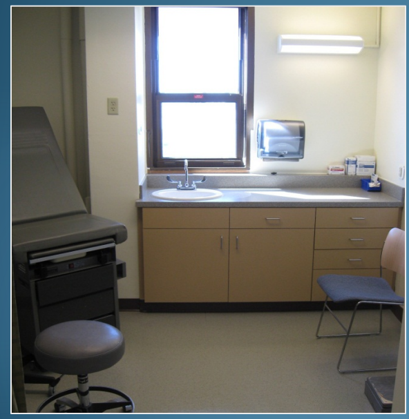
Two exam rooms